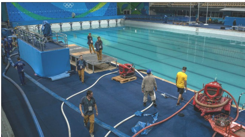
Workers drained the water from the water polo and synchronized swimming pool on Saturday.