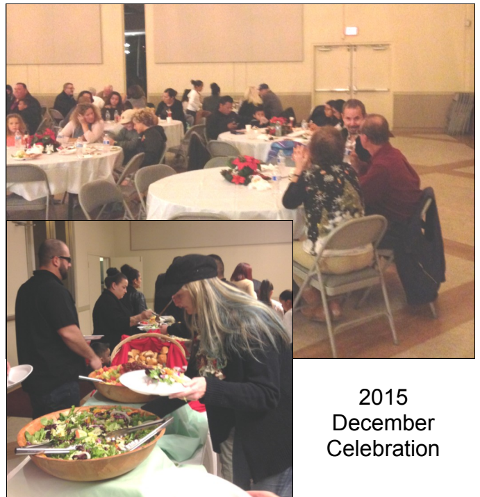
2015 December Celebration

Please return the bottles to the supply houses In the upright position. ( the same law applies to the delivery house drivers).