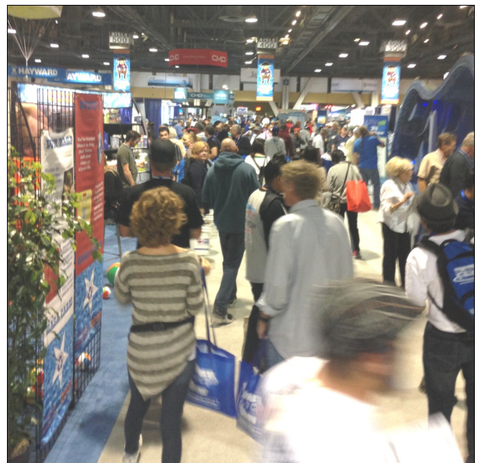
2016 Western Pool & Spa Show