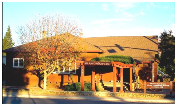
San Jose Clubhouse

The March 16th meeting will be at the new facility: 15480 Union Ave., San Jose, Ca 95124