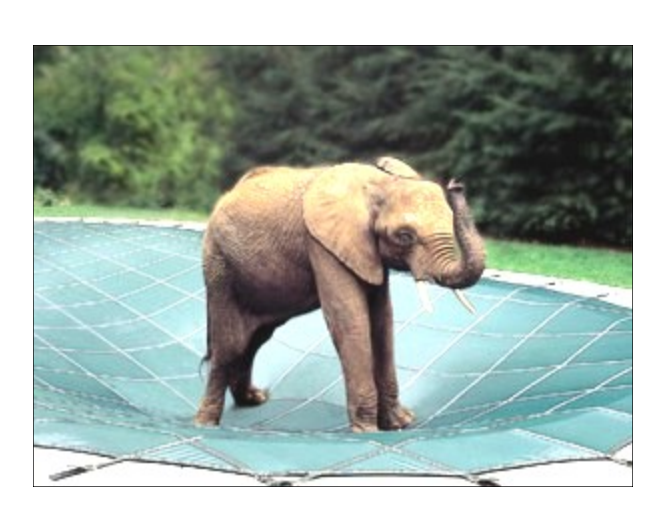
Nothing surprises the pool tech!